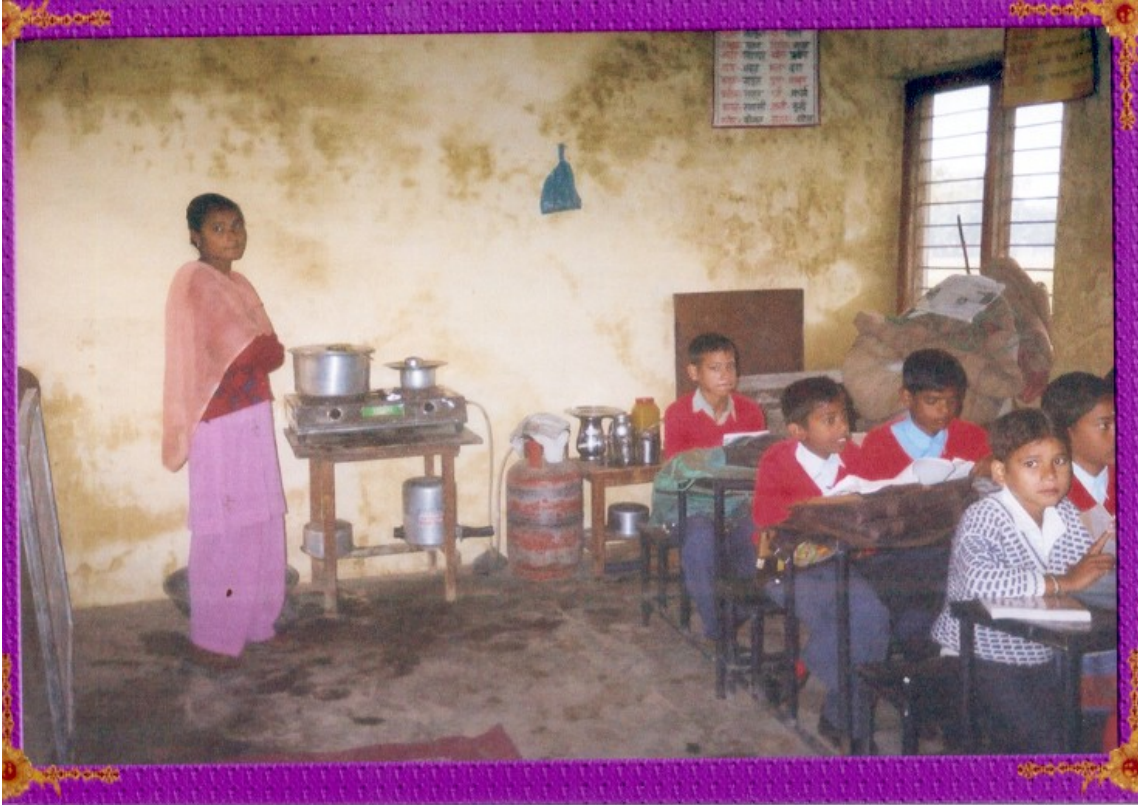
Fig.6.LPG is being used to prepare the Mid-Day Meal at UPS/MS Parwah.