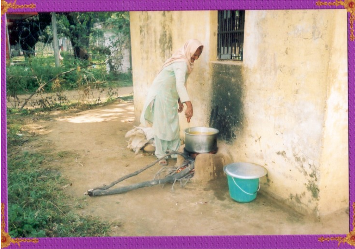
Fig.4.Mid-Day Meal Being prepared in the open by the cook at NPS, Kothey Netar.