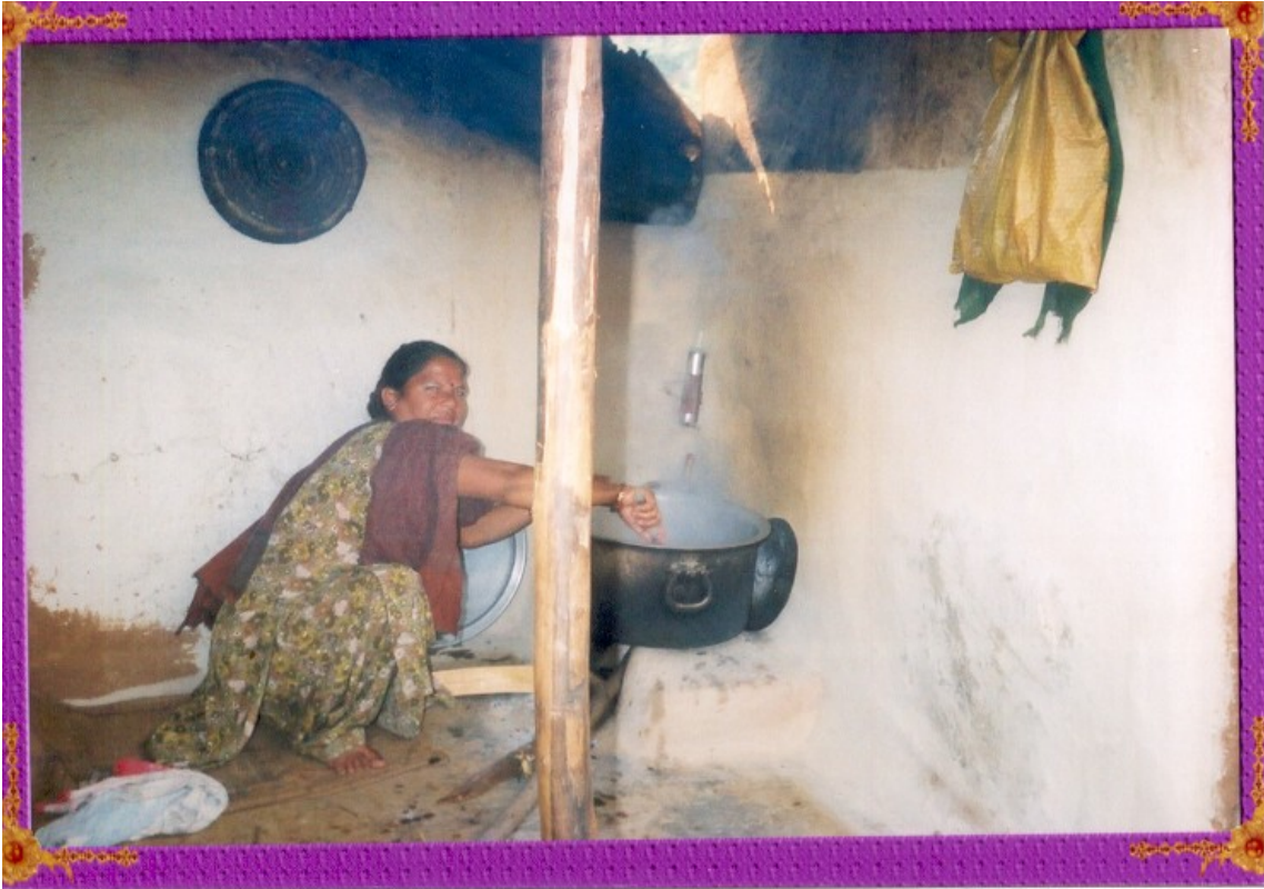
Fig.3. Cook preparing the Mid-Day Meal for Children at EGS Centre, Kranti Nagar.