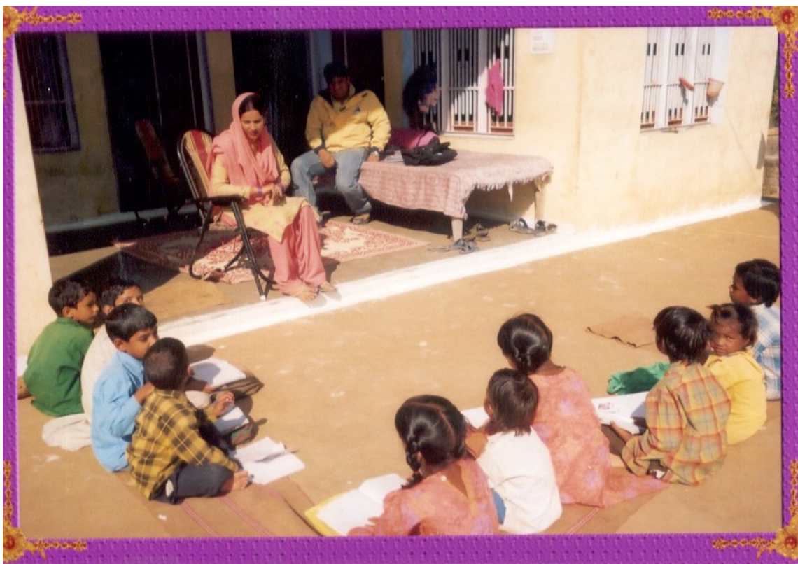
Fig.11.children present at EGS Kothey Pathania.