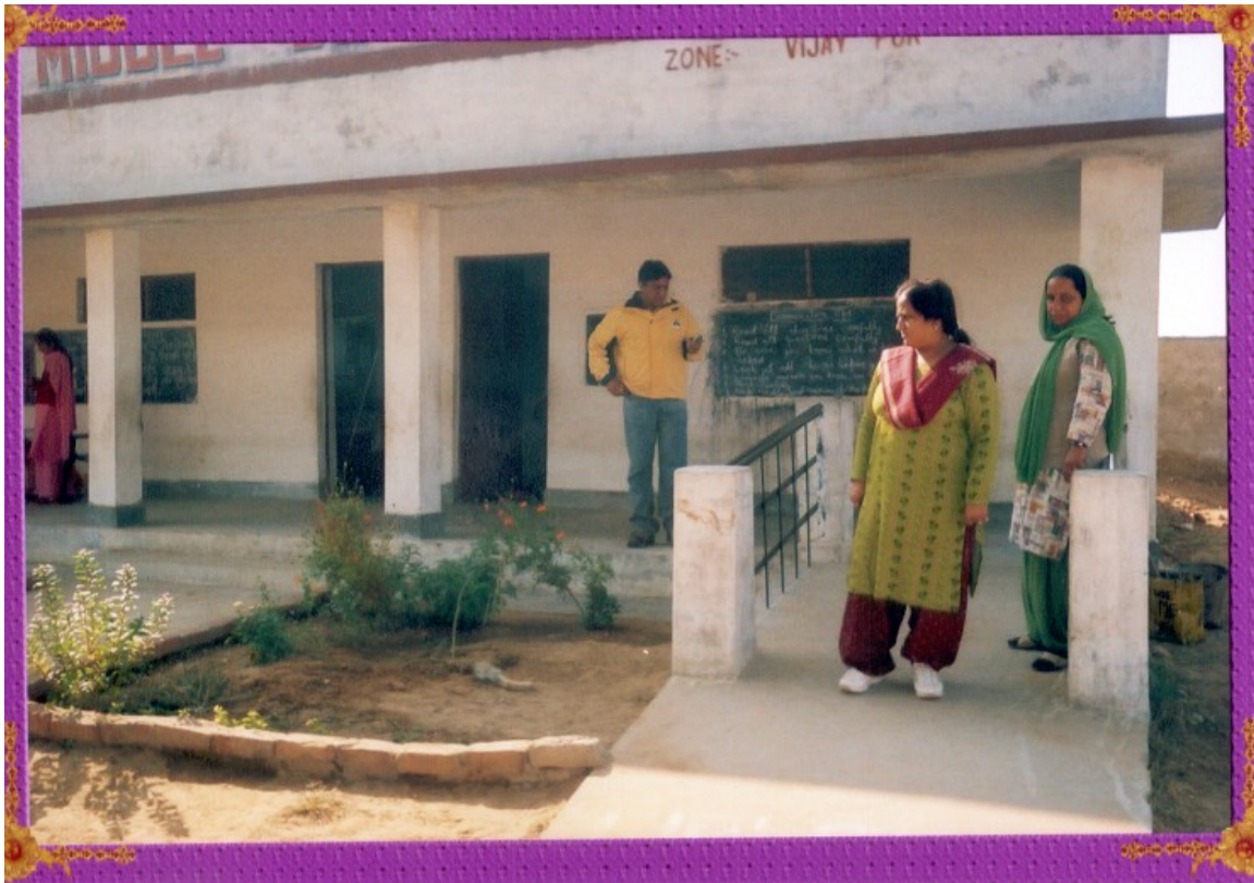
Fig.1.Ramp being constructed in UPS/MS Ranjari.