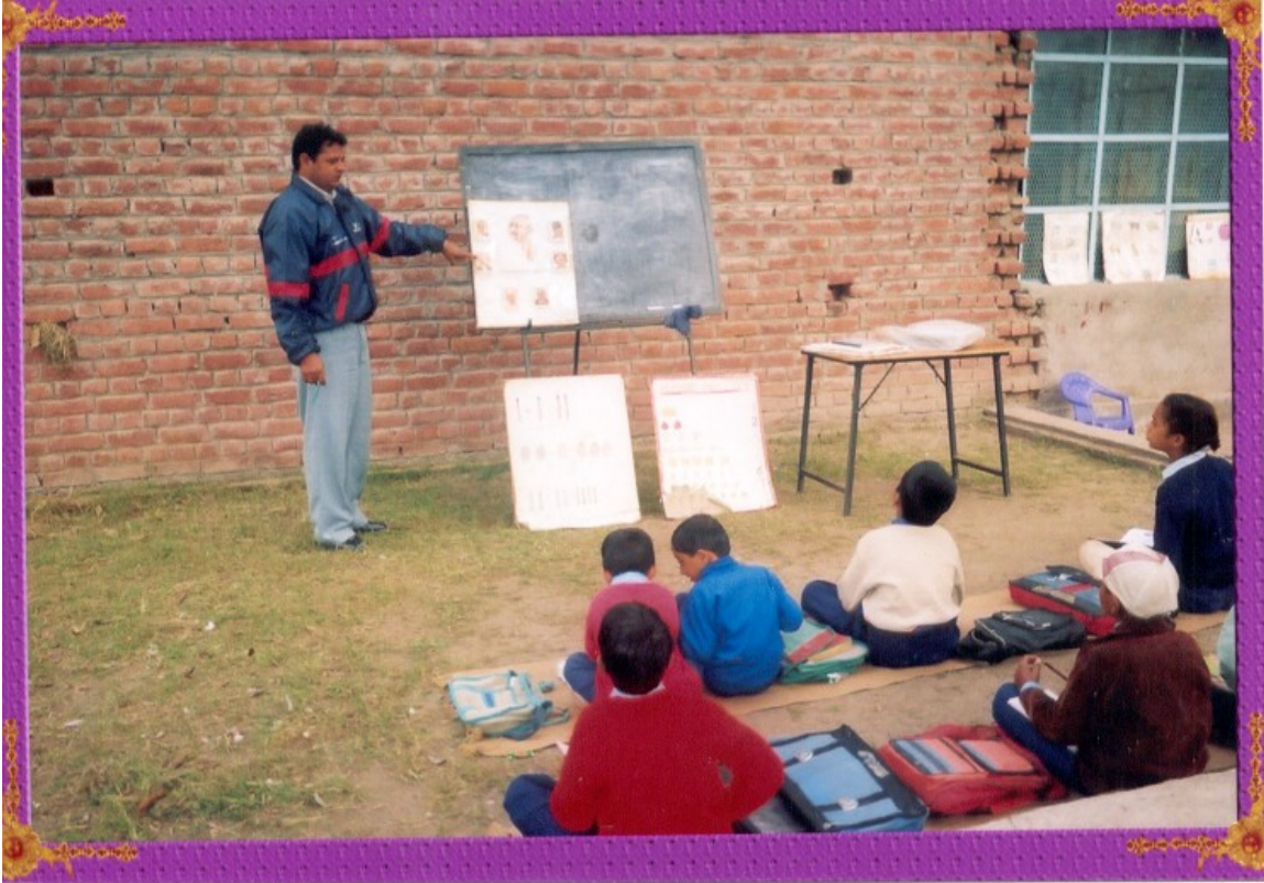
Fig.9.Children sitting in the open and being taught by the teacher at NPS Chak Jaggur.