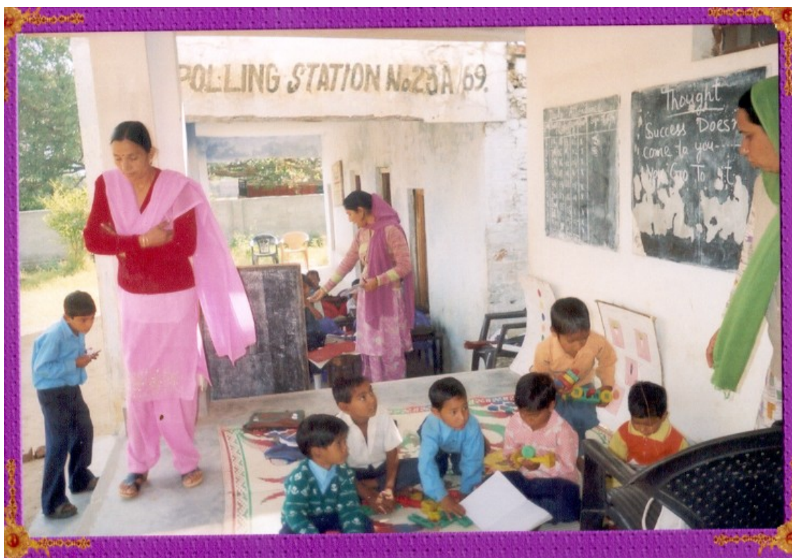
Fig.10.Children being provided with play material and engaged in activity at MS Ranjari.