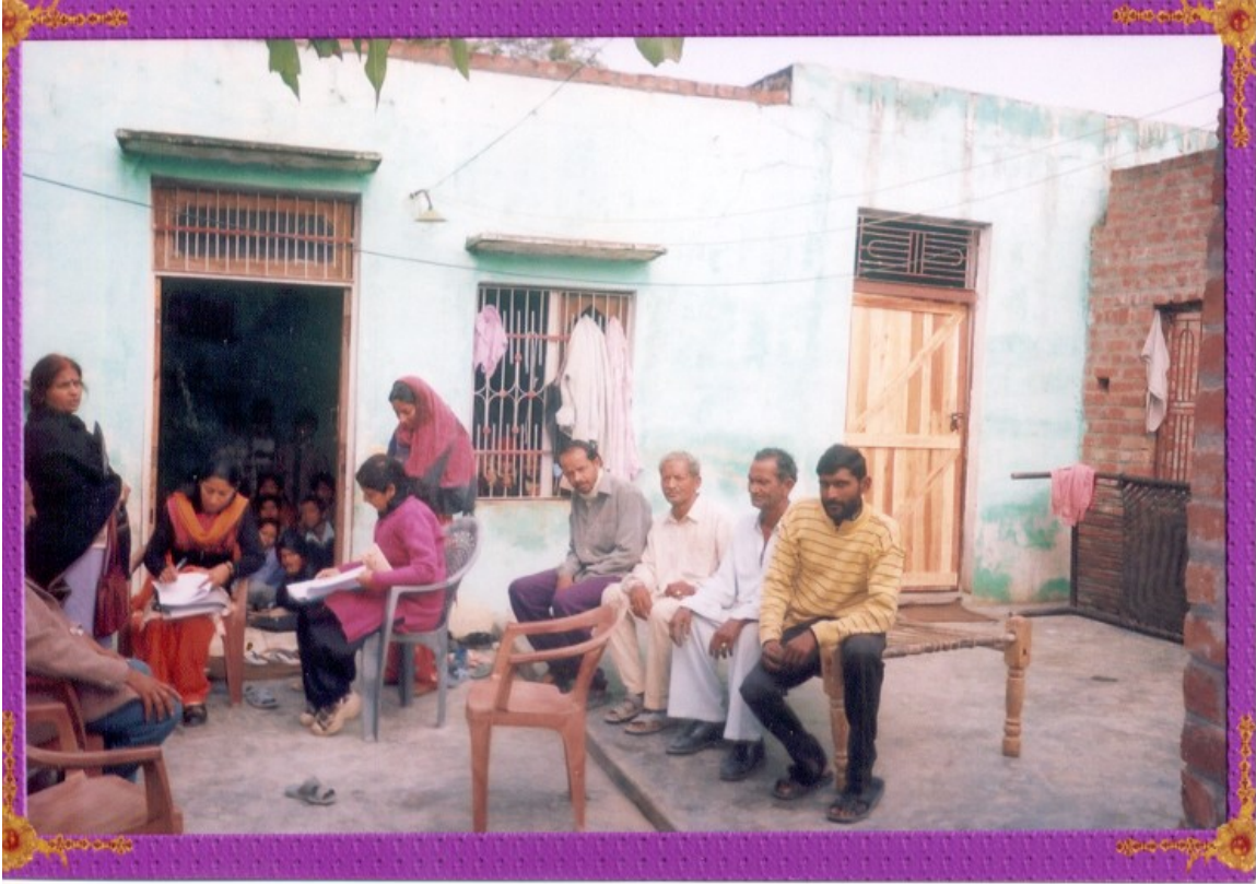
Fig.13.Information being taken by the members of Monitoring Institute at EGS W.No.14, Harijan Basti.