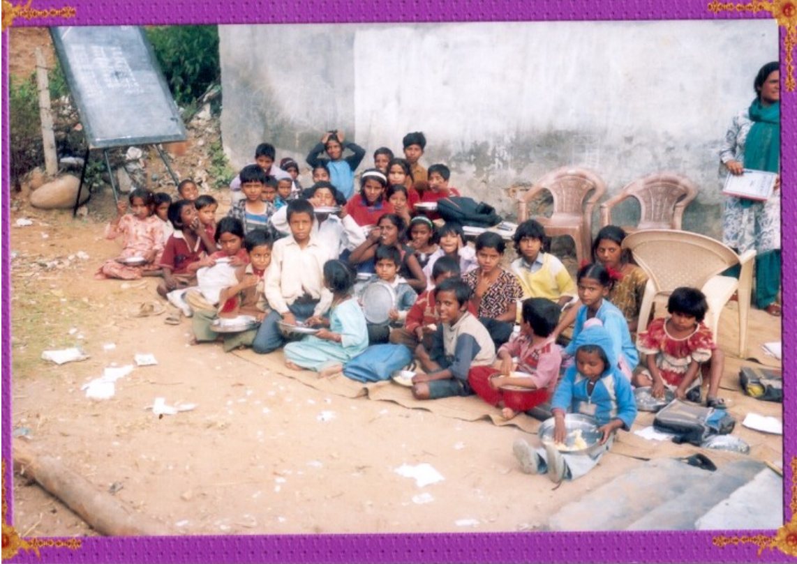
Fig.2.Children having Mid-Day Meal at EGS Centre,Kranti Nagar.