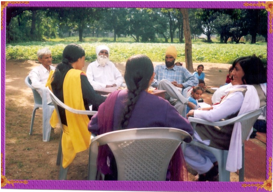
Fig.8.Male VEC members gathered at NPS Kothey Netar.