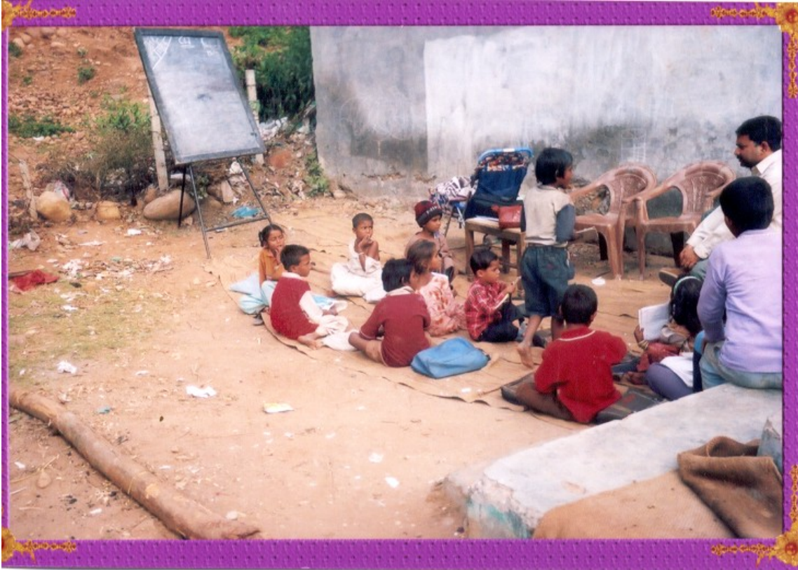
Fig.7. Dust and dirt lying near the children at EGS Centre, Kranti Nagar.