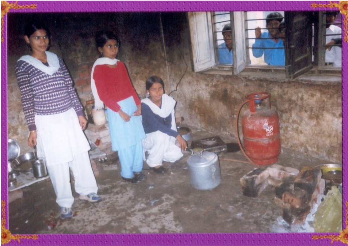
Fig.12.Girls preparing the Mid-Day Meal in the Absence of Cook at UPS Chak Desa Singh.