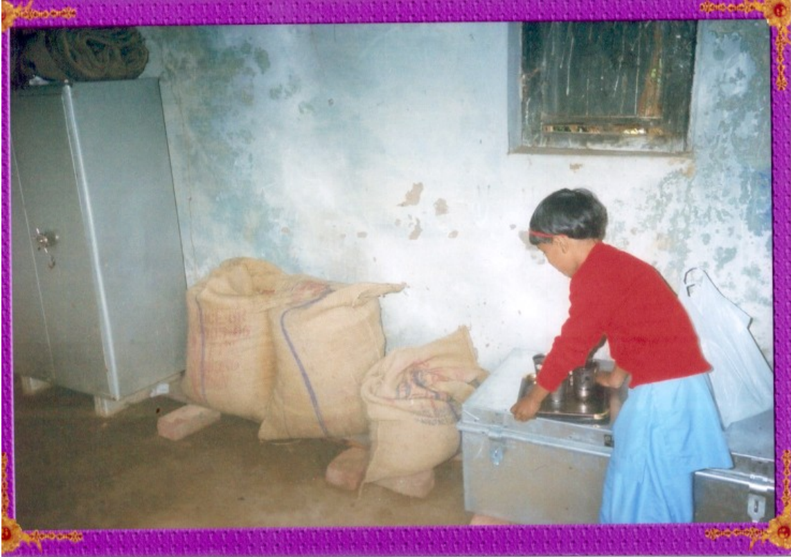
Fig.5.Foodgraing being stored in the jute bags at NPS,Kothey Netar.